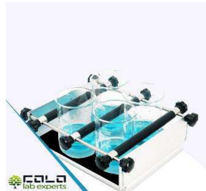
Universal platform with two, three or four standard horizontally adjustable bars rubber-coated. The two longitudinal stainless steel brackets can adjust the horizontal bars to a height of 25mm/45mm/65mm above the platform