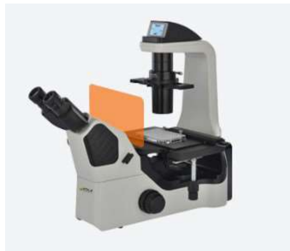
INVE700F Inverted Fluorescence Microscope