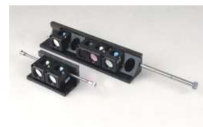
Two-Band or three-band Filter Block Switching mechanism