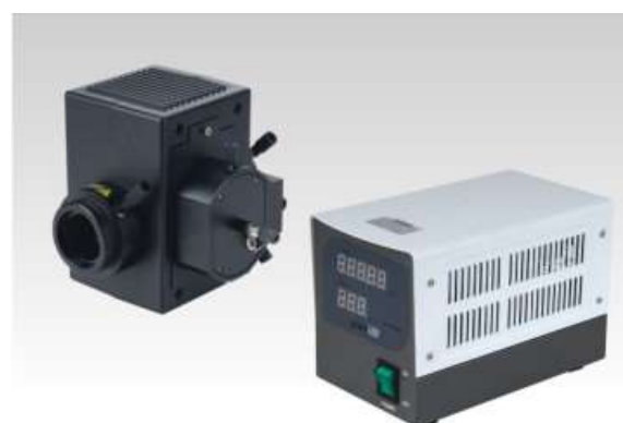
Mercury lamp power supply and power system

High performance excitation fluorescence filters blue, green... We can also provide specialized filter module for fluorescent probes according to the special requirements of detection and analysis